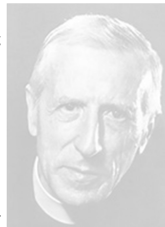
Pierre Teilhard de Chardin SJ

Don't try to force them on as though you could do today what time (that is to say, grace and circumstances acting on you own good will) will make you tomorrow. Only God could say what this new spirit gradually forming within you will be. Give Our Lord the benefit of believing that His hand is leading you and accept the anxiety of feeling yourself in suspense and incomplete.